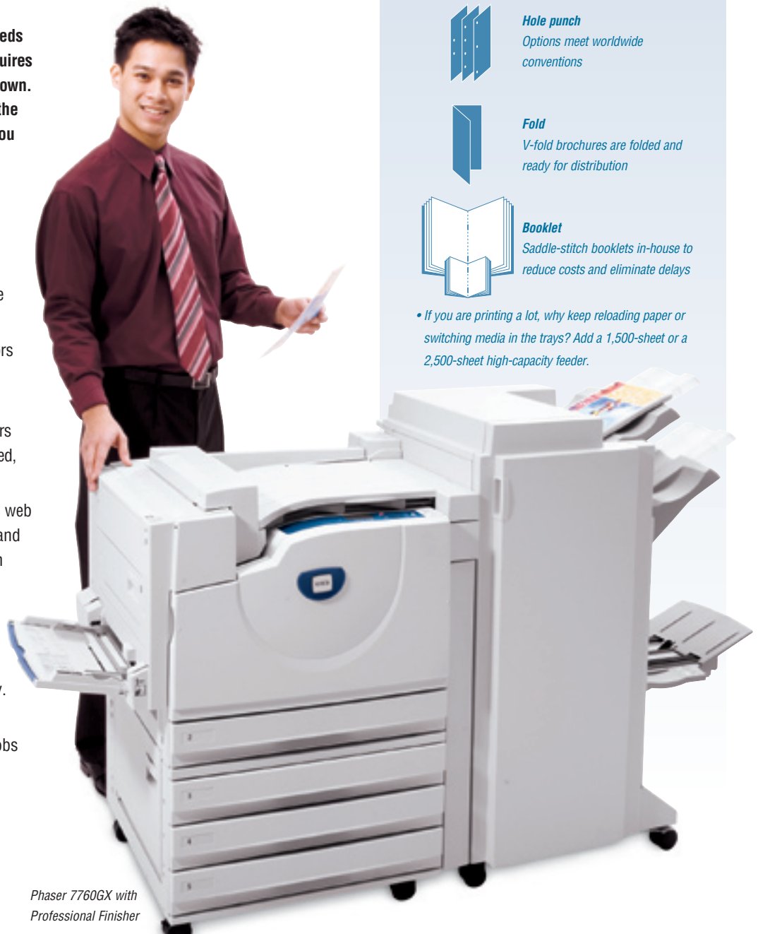
Phaser 7760GX with Professional Finisher