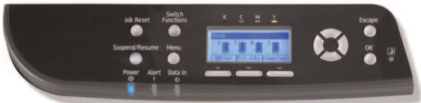
An intuitive, easy-to-read four-line control panel speeds and simplifies operation.

Businesses face new pressures today. To compete, you need to move faster, deliver more and spend less. The SAVIN® SP C320DN Color Laser Printer addresses these challenges and helps you succeed. This ultra-quick printer offers an Economy Color Mode that lets you choose when to print draft- or review-quality documents and when to print presentation-quality documents. This breakthrough capability fits perfectly with a Managed Print strategy that can help you monitor, control and improve output. Other new capabilities—including an ECO Night Sensor that automatically powers down the printer after-hours and robust security features that safeguard documents and data—deliver entirely new and sustainable cost savings.